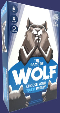
The Game of Wolf

Keep the party going with these other games from Gray Matters