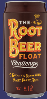
The Root Beer Float Challenge